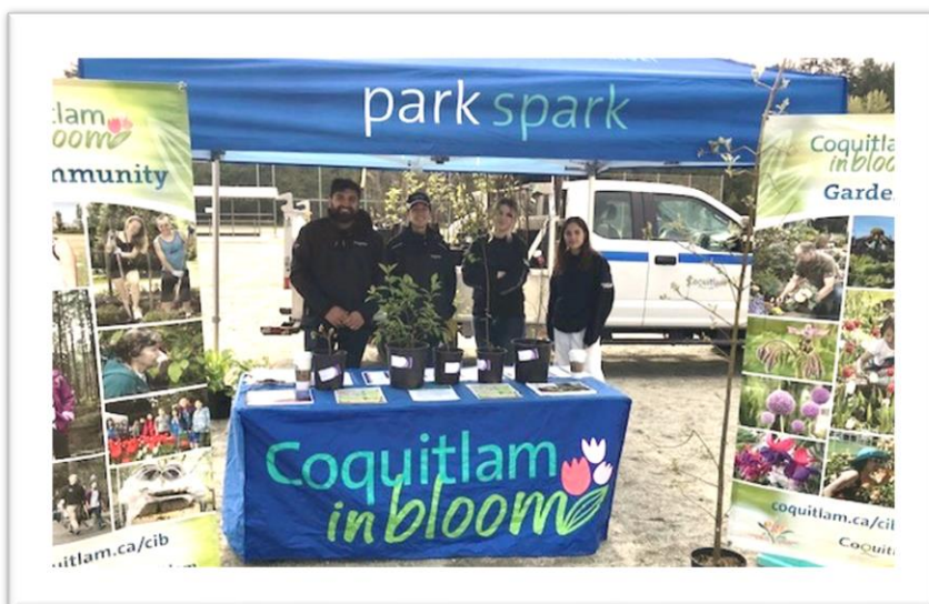
CITY OF COQUITLAM – TREE SPREE EVENT as featured in the BC CiB Growing Together Newsletter Oct. 2022 issue.