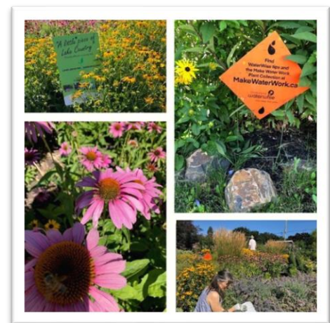
LAKE COUNTRY GARDEN CLUB Xeriscape, Pollinator Garden with bug hotel project as featured in the BC CiB Growing Together Newsletter Aug 2023 issue.