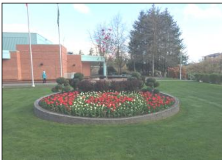
City of Abbotsford