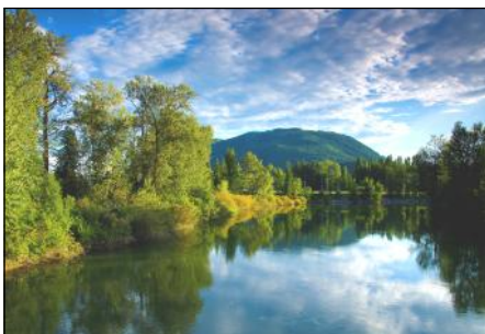
District of Sicamous

Two membership levels that may be of interest to smaller communities with exceptional municipal parks, heritage properties or local gardens: