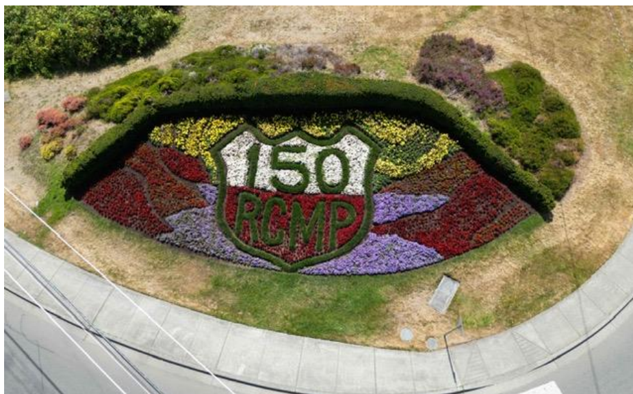
Parksville display garden submitted by a friend in Qualicum Beach!

And of course, all our CiB communities: 100 Mile House, Abbotsford, Armstrong, Castlegar, Coquitlam, Hope, Kitimat, Prince George, Qualicum Beach, Sicamous, Trail, Clinton!