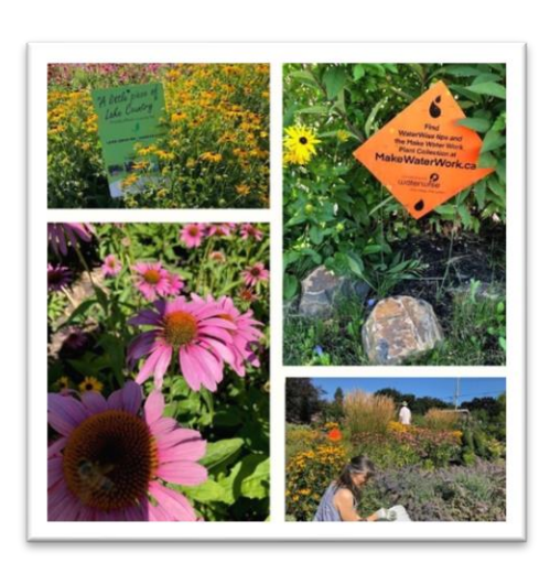
LAKE COUNTRY GARDEN CLUB Xeriscape, Pollinator Garden with bug hotel project as featured in the BC CiB Growing Together Newsletter Aug 2023 issue.