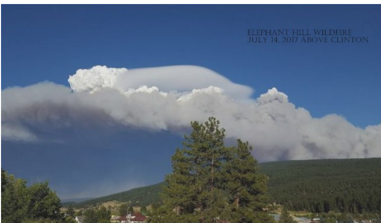
ELEPHANT HILL WILDFIRE JULY 14, 2017 ABOVE CLINTON

This event is made possible by a number of sponsors and a successful grant application to the BC Wildfire Recovery Operation, Canadian Red Cross Western Zone through the Canadian Red Cross - Community Partnerships Program British Columbia Fires 2017.