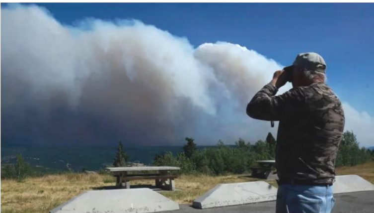
An evacuee stops to take pictures of smoke clouds from a parking lot near Clinton, B.C., in July 2017. RCMP have set up a dedicated tip line for information about last summer's devastating Elephant Hill wildfire.