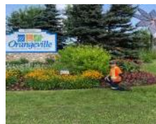
Orangeville, ON - Environmental Action Award Winner, presented by the Canadian Nursery and Landscape Association

Environmental Action pertains to the impact of human activities on the environment and the subsequent efforts and achievements of the community with respect to environmental stewardship, policies, by-laws, programs and best practices for waste reduction and landfill diversion, composting sites, landfill sites, hazardous waste collections, water conservation, energy conservation, and activities under the guiding principles of sustainable development pertaining to green spaces.