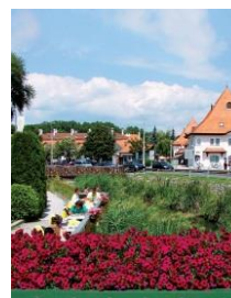
Mosonmagyaróvár, Hungary - International Community Involvement Award, presented by Communities in Bloom