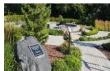
Melfort, SK - Landscape Award Winner, presented by Scotts® Turf Builder®

Landscape includes planning, design, construction and maintenance of parks, green spaces and cemeteries suitable for the intended use and location on a year-round basis. Elements for evaluation include native and introduced materials; biodiversity, materials and constructed elements; appropriate integration of hard surfaces and art elements, use of turf and groundcovers. Landscape design should harmonize the interests of all sectors of the community and provide safe and secure public spaces. Standards of execution and maintenance should demonstrate best practices, including quality of naturalization, use of groundcovers and wildflowers along with turf management.