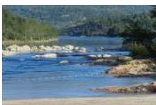
Trail, BC – Community Appearance Award Winner, presented by TECK

Community Appearance reflects an overall effort by the municipality, businesses, institutions and the residents throughout the community to create great first impressions and a sense that there is continuous attention and upkeep to critical elements of a community that benefit quality of life and economic vitality. Elements for evaluation are: parks and green spaces, medians, boulevards, sidewalks, streets; municipal, commercial, institutional and residential properties; ditches, road shoulders, vacant lots, signs and buildings; weed control, litter clean-up, graffiti prevention/removal and vandalism deterrent programs.