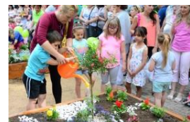
Székesfehérvár, Hungary - International Youth Involvement Award, presented by CiB