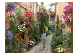
Spello, Italy - International Floral Displays Award, presented by Ball

- With the introduction of this enhanced higher award standards, the marking of scores will be more critical.