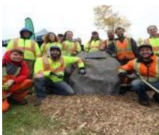
Brandon, MB - Tree Management Award Winner, presented by CiB

Tree Management Woodlands, Canopy Management, Urban and Rural Forestry includes the efforts of the municipality, businesses, institutions and residents with regards to written policies, by-laws, standards for tree management protection (selection, planting, and maintenance), long and short-term management plans, tree replacement policies, pollinator-friendly tree selection, tree inventory including heritage, memorial, and commemorative trees, and Integrated Pest Management (IPM) programs.