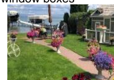
Cold Lake, AB – Plant and Floral Displays Award Winner, presented by the National Capital Commission

Plant and Floral Displays evaluates the efforts of the municipality, businesses, institutions and residents to design, plan, execute, and maintain plant and floral displays of high-quality standards. Evaluation includes the design and arrangements of flowers and plants (annuals, perennials, bulbs, ornamental grasses, edible plants, water efficient and pollinator friendly plants) in the context of originality, distribution, location, diversity and balance, colour, and harmony. It also pertains to flowerbeds, carpet bedding, containers, baskets and window boxes