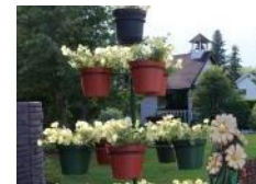
Millet, AB - Heritage Conservation Award Winner, presented by CiB

Heritage Conservation includes efforts to preserve and protect both natural and cultural heritage within the community. Preservation of natural heritage pertains to policies, plans and actions concerning all elements of biodiversity including flora and fauna ecosystems and associated geological structures and formations. Cultural conservation represents the “persona” of a community and refers to the heritage that helps define the community including the legacy of tangible elements such as heritage buildings, monuments, memorials, cemeteries, artifacts, museums and intangible elements such as traditions, customs, festivals and celebrations.