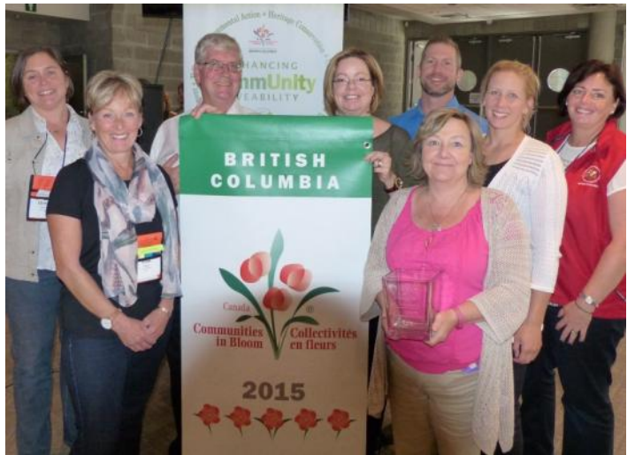
Coquitlam with 5-Bloom Banner and Province of BC Heritage Criteria Award