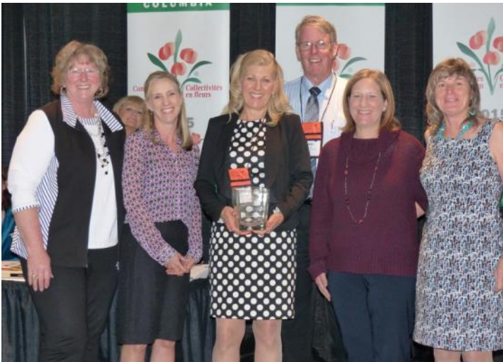
Urban Systems present Cache Creek a Resilient Community Spirit Award