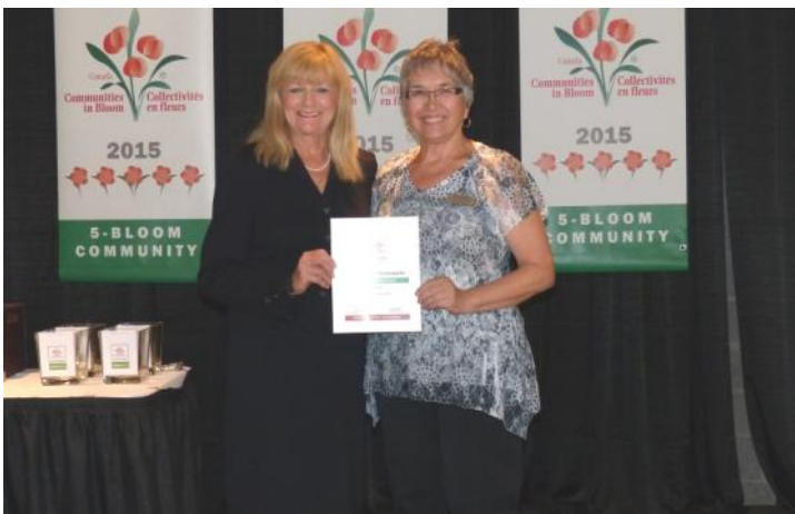
Bowen Island Novice Certificate Presentation