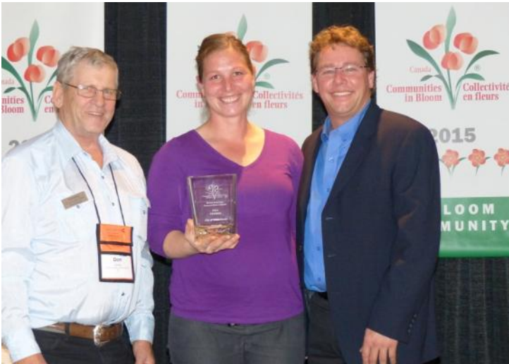
Teck Tidiness Award went to Whitehorse, Yukon