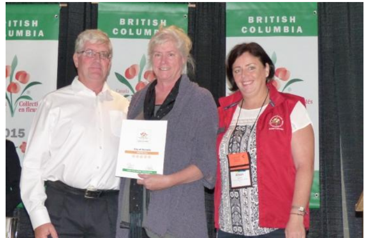
City of Burnaby also recognized for BC CiB Community Membership

2015 was an atypical year as we were included in the National Symposium Week. There were great opportunities for networking and education as Kamloops hosted a world class event.