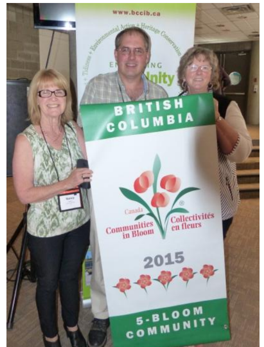
Another 5-Bloom Winner: Salmon Arm with their first 5-Bloom Banner!