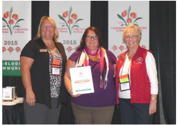
Sun Rivers recognized for Community Membership in BC Provincial Program