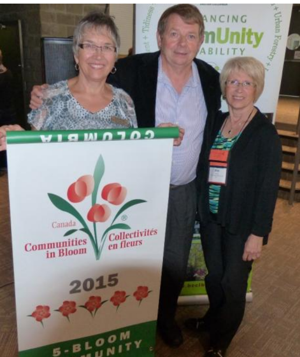
Hope was recognized with another 5-Bloom Banner and their mentoring of the small historical community of Yale.