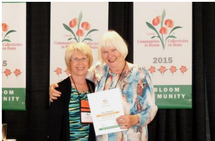
Kelowna Showcase Recognition