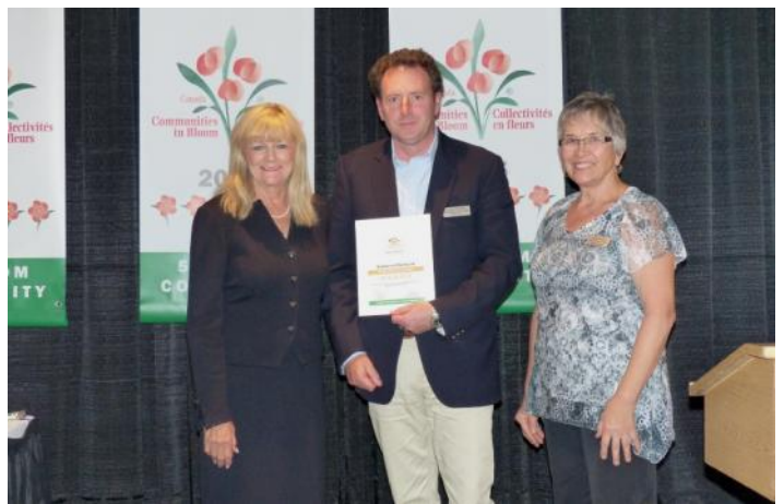
Fort St. John Bloom Certificate Presentation