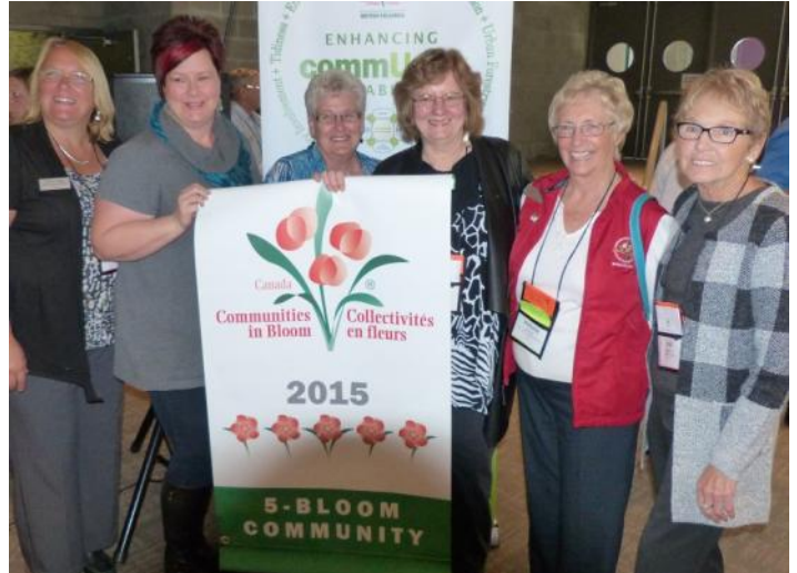
Barriere with their first 5-Bloom Banner!